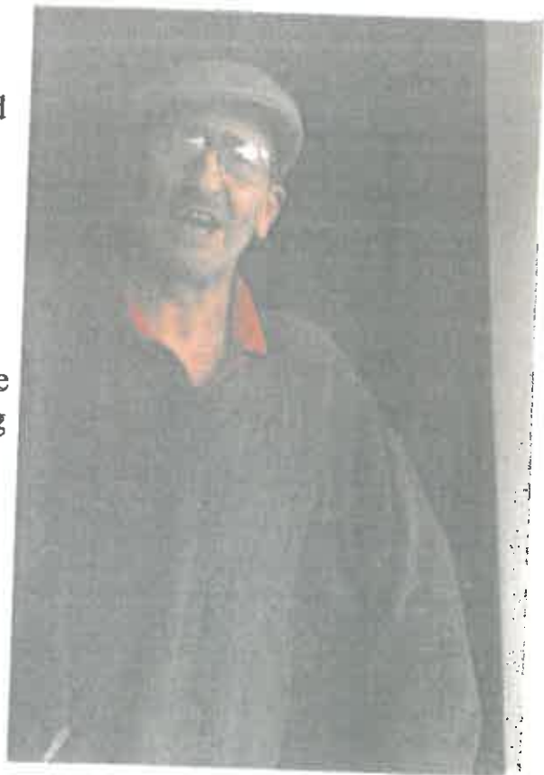
A very grateful resident